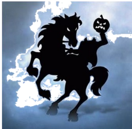
Middlesex Community College Foundation, Inc.

Course is a secure, grassy field on the MxCC campus